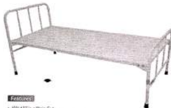
KW-437 Plain Cot