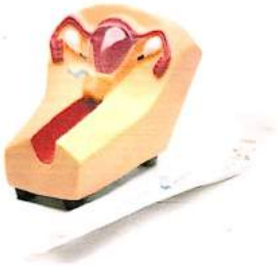
IUCD DEVICE MODEL FOR TEACHING