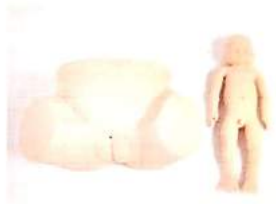
MATERNAL AND NEONATAL BIRTHING TORSO